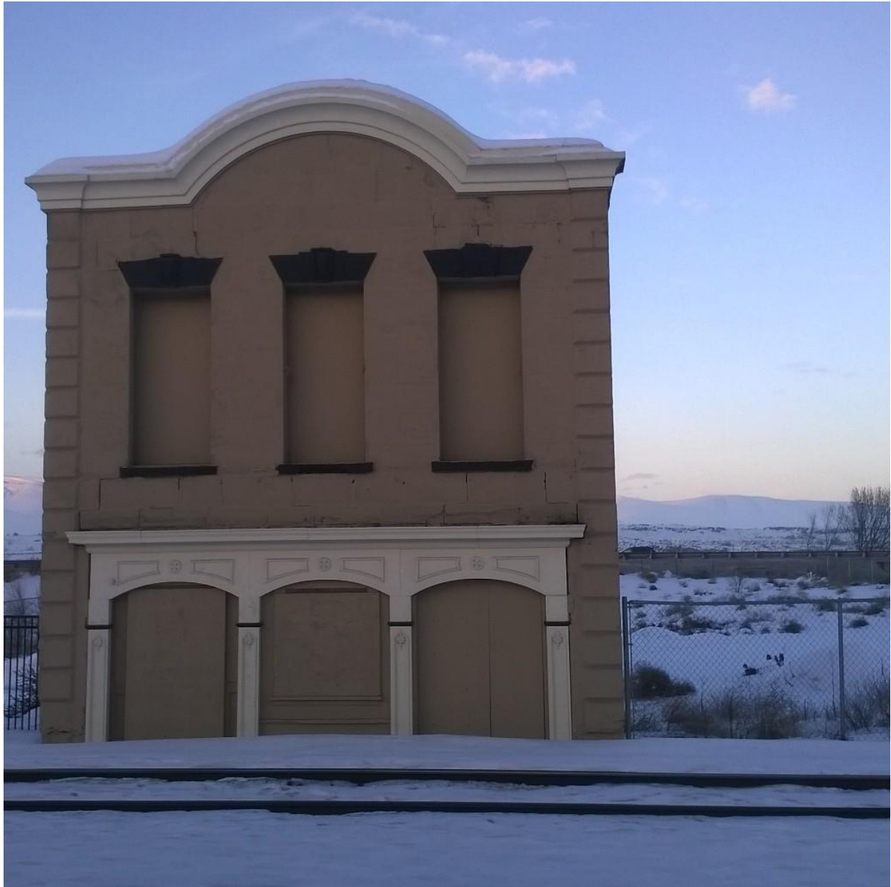
FIGURE 2: WALDRON BROTHERS DRUGSTORE, THE DALLES OREGON, JANUARY 2017, FACING NORTH.