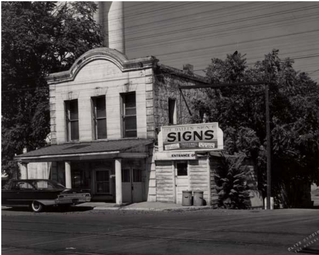
FIGURE 4: HISTORIC PHOTOGRAPH OF THE WALDRON BROTHERS DRUGSTORE, THE DALLES, OREGON. TAKEN BEFORE THE RAILROAD TRACKS WERE SHIFTED TO THE NORTH.