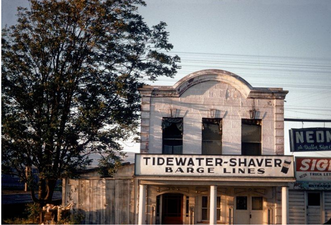
FIGURE 3: HISTORIC PHOTOGRAPH OF THE WALDRON BROTHERS DRUGSTORE, THE DALLES, OREGON