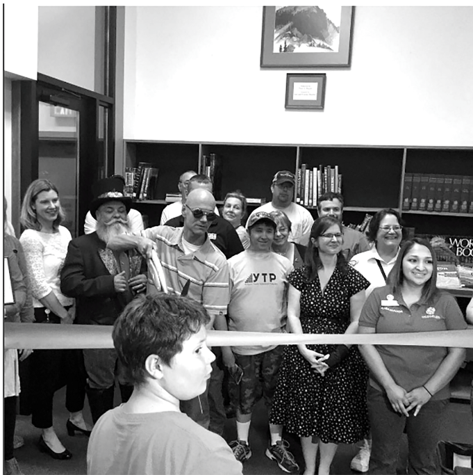
Ribbon Cutting for the new Teen Space at The Dalles Wasco County Library

Check out The Dalles Wasco County Newsletter for information on summer programs.