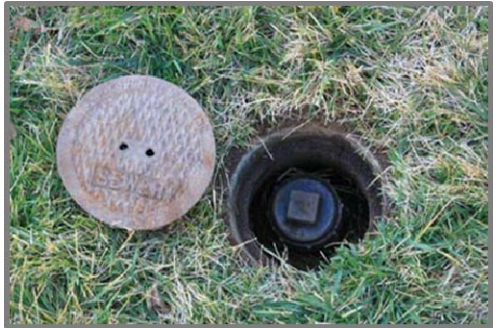
A typical sewer clean out is a pipe with a threaded plug. The plug may or may not be covered as shown.