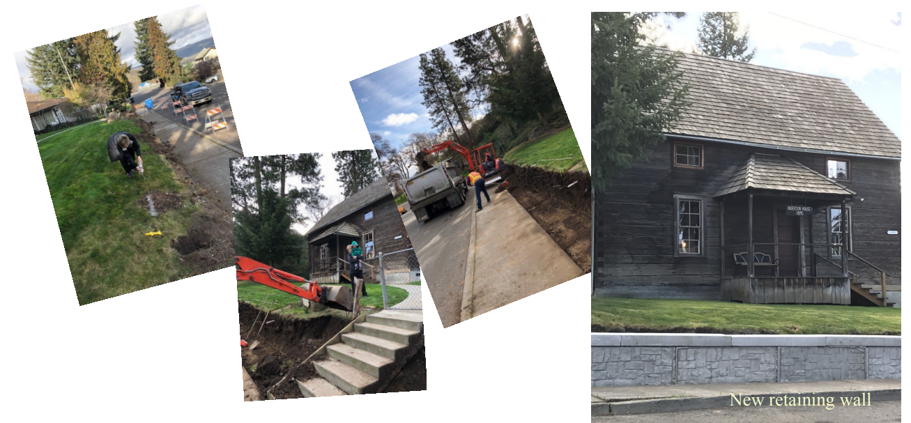
New retaining wall