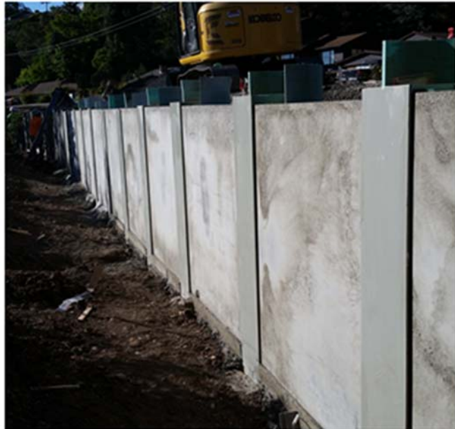
About 600 linear feet of soldier pile retaining wall was installed in 2015 during Phase 1 of the East Scenic Drive Stabilization Project.

The City plans to tackle this large public works project in several phases. A total of 1,100 feet of soldier pile retaining wall system is planned. In 2015, Phase 1 installed nearly 600 linear feet of retaining wall. Phase 1 also included reconstruction of the storm water collection system.