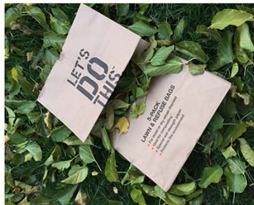
Please join us in Operation Clean Sweep in The Dalles, OR. Put leaves in compostable paper bags. Take bagged leaves to The Dalles Disposal, located at 1317 West First Street, Monday through Friday between 9 am and 4:30 pm.

Clear storm drains in front of your house to prevent flooding during a rainstorm.