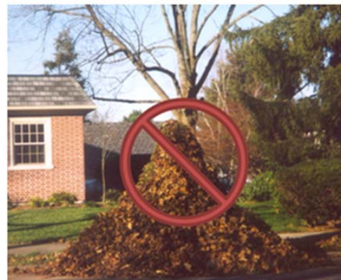
Please help us with Operation Clean Sweep in The Dalles, OR. Do not rake leaves from your yard into the street. Citizens are asked to park off the street during street sweeper work hours on weekdays 7:00 a.m. to 3:30 p.m.