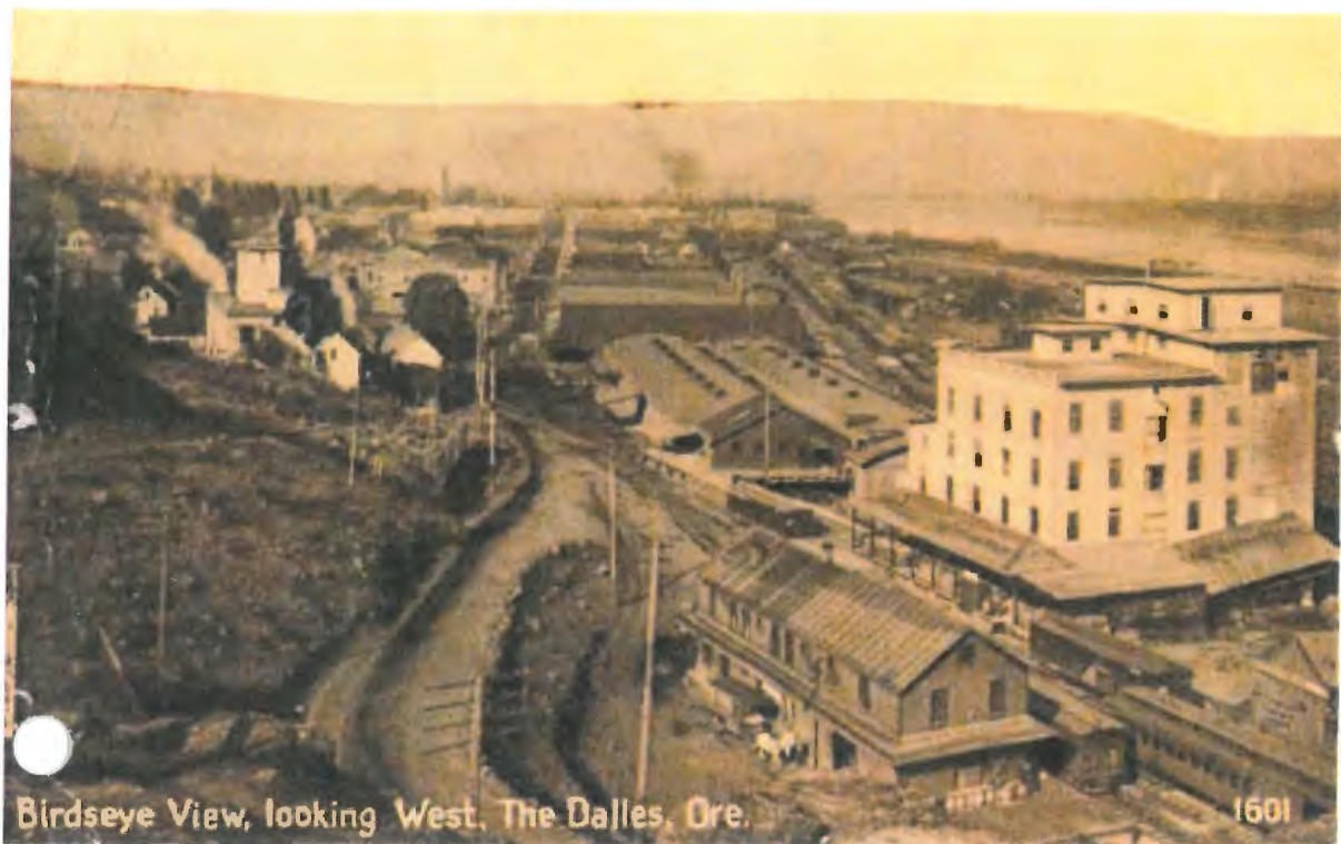
Birdseye View, looking West, The Dalles, Ore.