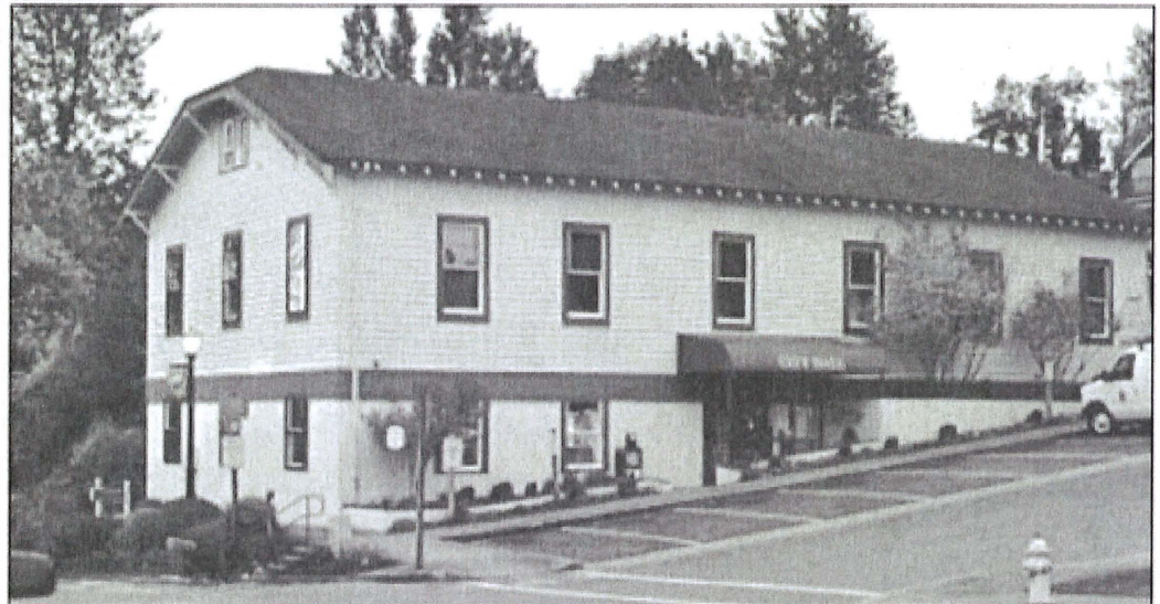
OLD CITY HALL IN TROUTDALE

The alternative is to continue renting commercial office space at dispersed locations and ever-increasing rents. Since moving out of City Hall, because the building needed structural re-