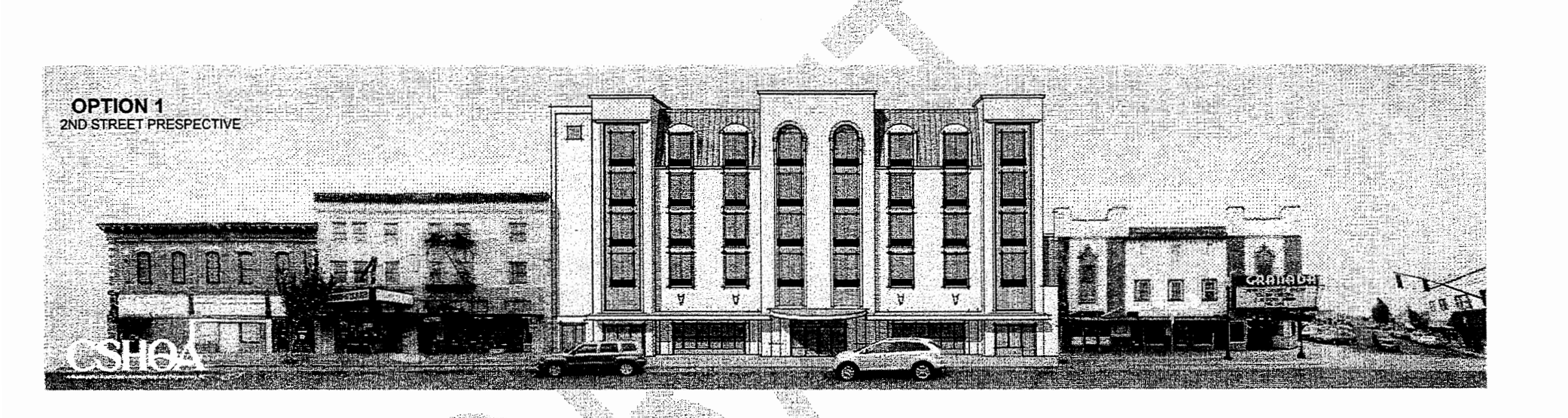
EXHIBIT B-1, page 1