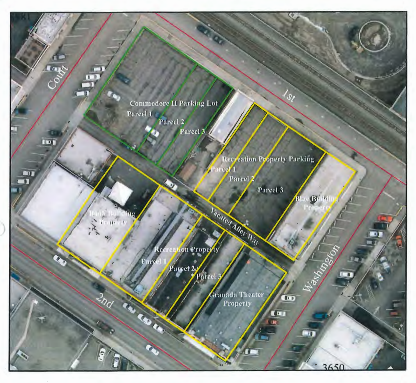
EXHIBIT A-1 SKETCH OF PROJECT SITE