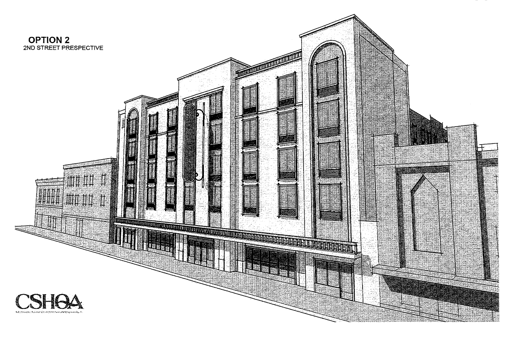
EXHIBIT B-1, page 2

Confidential Information: Subject to confidentiality, disclaimer and risk factors by Wave Hospitality Advisors and its affiliates. All information is preliminary and subject to further revision.