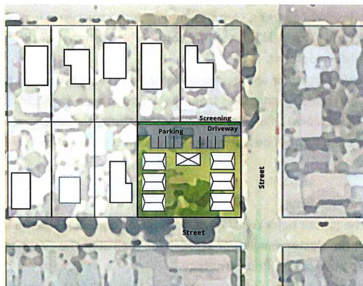
Figure 1: Example of Cottage Cluster Layout on Infill Lot

4. Community buildings. Cottage cluster developments may include community buildings that provide space for accessory uses such as community meeting rooms, guest housing, exercise rooms, day care, or community eating areas. They shall have a footprint of no more than 800 square feet unless there is an existing dwelling that is renovated for community building space.