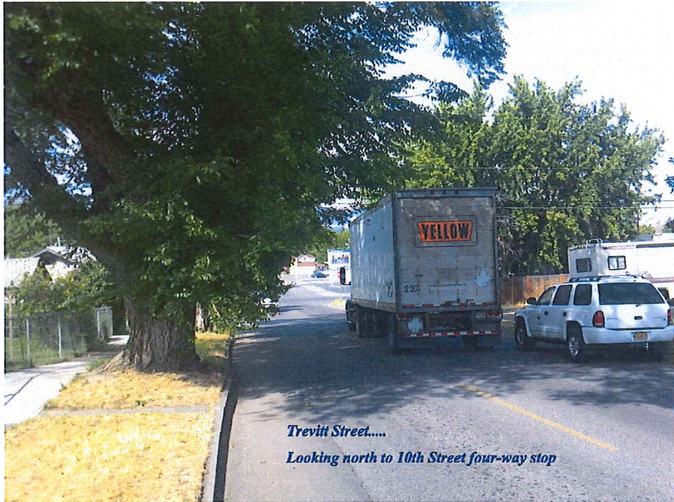
Trevitt Street.... Looking north to 10th Street four-way stop