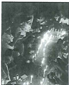
Bangladesh on the edge

DAN SANCHEZ replaces a wiper blade, casualty of the snow, ice and arctic temperatures, during a busy shift at Les Schwab Tires. Crews rushed to mount snow tires during the past week as motorists struggled to drive in snow and ice. Rain, and possibly freezing rain, are predicted Thursday as temperatures waver between lows at freezing overnight and in the 40s during the day.