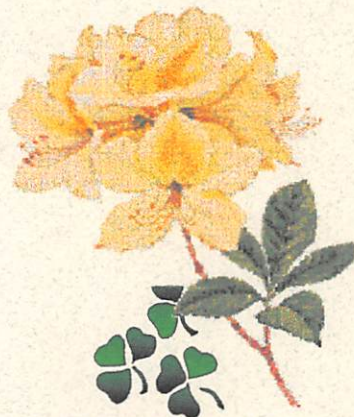
R. "Mollis Hybrid Azalea"

Sure 'n b'darlin' tis clover ya see b'neath those winter'n flowers in Brookings, Oregon