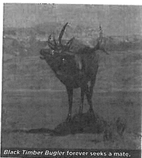
Black Timber Bugler forever seeks a mate.